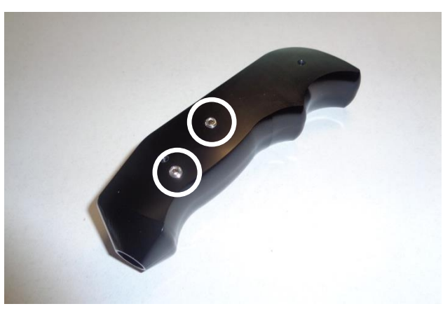
2. Thread the 4 set screws (Item 5) into the shifter handle body (1) until they are almost flush with the handle body. (Two screws each side.)