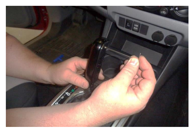
5. Install the left and right side plates (2) and (3) with the 4 flathead screws (4). (Two screws each side.)