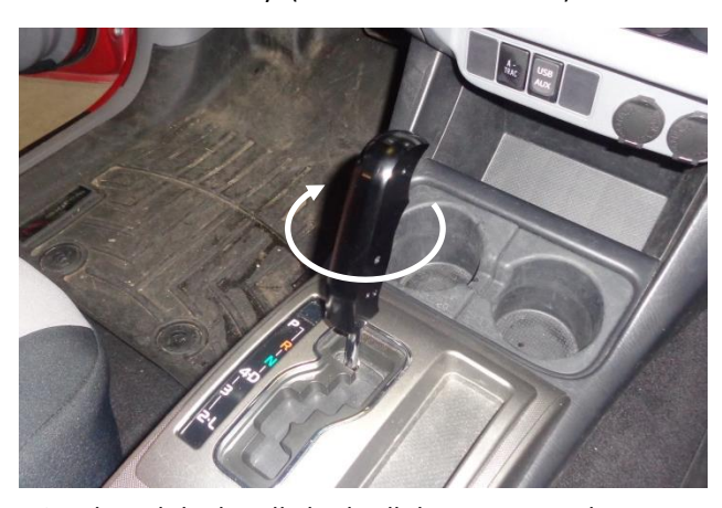
3. Thread the handle body all the way on to the shifter stick.