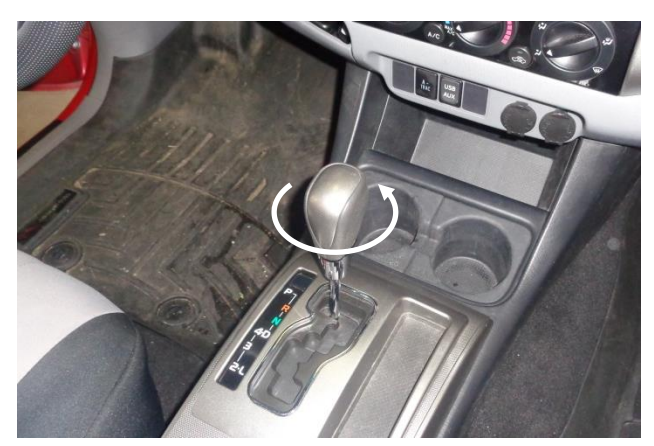
Turn off your vehicle's ignition and set the parking brake. Remove the stock shifter handle by rotating it counter-clockwise on the shifter stick.