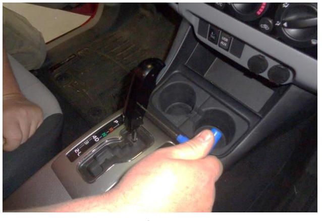
4. Properly align the shift handle by backing it up slightly, then tighten all four set screws.