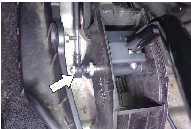
16. Push the end of the transfer case shifter cable back onto its pin until you hear or feel it "click" in place, then verify the security of the connection. Verify smooth movement of the shift lever throughout its entire range.