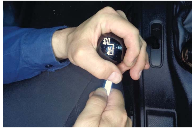
23. Tighten the jam nut against the knob.