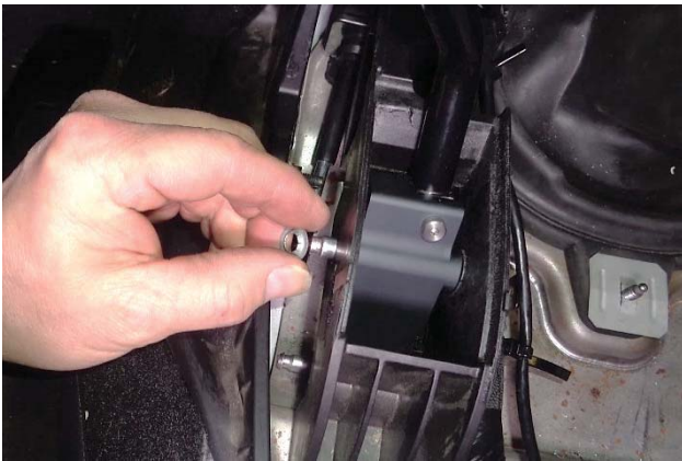
15. Push the retainer onto the tip of the pivot pin.