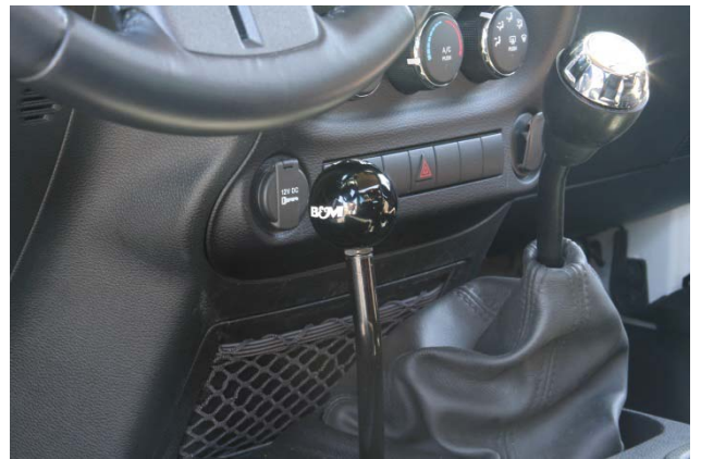
Congratulations, the installation of your B&M Transfer Case Shift Handle is now complete!