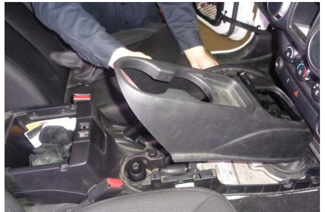
18. Open the center console storage lid, and carefully reinstall the center console cover.