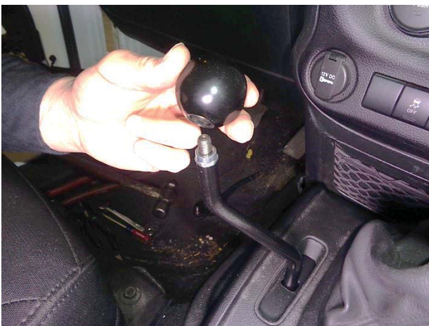
22. Install the shift knob (1) on the shift lever. Thread it on to the lever as far as possible with the shift pattern correctly oriented.

IMPORTANT: RETAIN THESE INSTRUCTIONS FOR FUTURE REFERENCE