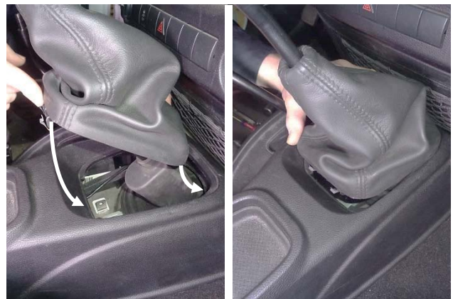
19. Slip the leather boot over the gearshift lever. Slip the 2 front hooks under the edge of the console cover, then press the 2 rear locking tabs into place.