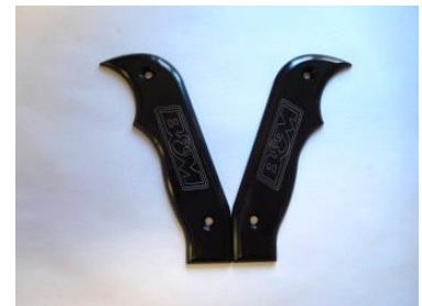
Gearshift Handle Grip Plates