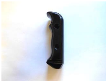
Transfer Case Handle