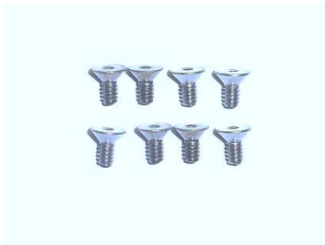
6-32 x 5/16" Flat Head Screw (8)