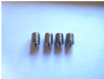
10-32 x 5/16" Cone Point Set Screw (4)