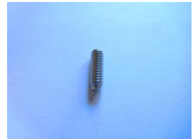
8-32 x 1/2" Set Screw