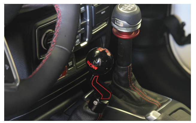
Congratulations, the installation of your B&M Transfer Case Shift Handle is now complete!

20. Thread the shift knob (1) all the way down the screw, then back it off just enough to give the desired shift pattern alignment. Use a slim-profile 9/16" wrench to tighten the jam nut against the knob.