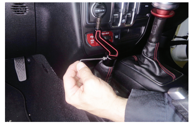
18. Apply medium strength thread locking fluid to cap screw (4) and install it in the shift handle.