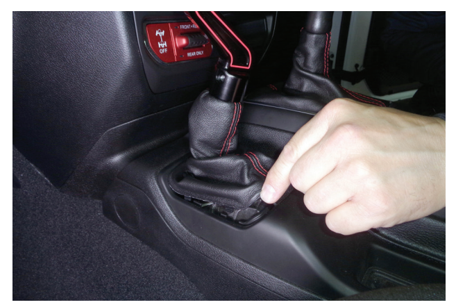
17. Pull the shift boot down and snap the boot frame into the center console.