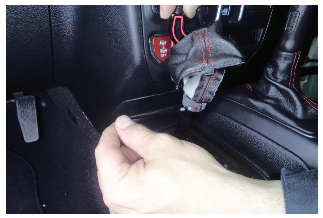
16. Apply medium strength thread locking fluid to set screw (5) and install it in the shift handle.