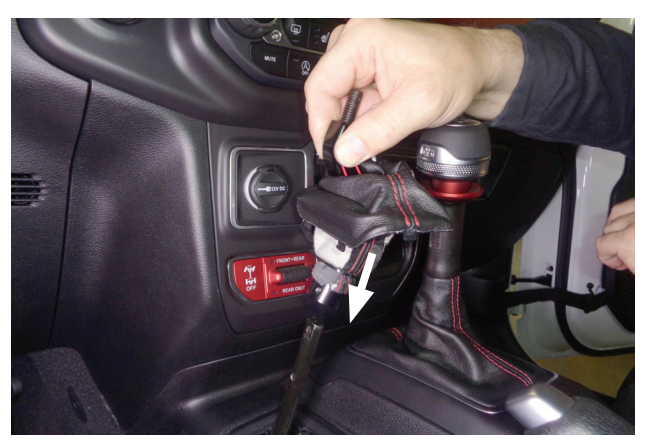
15. Install the shift handle and boot over the shift lever.