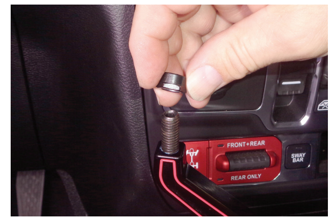
19. Run the jam nut (2) all the way down the knob screw, with the wrench flats facing down.