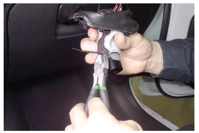
14. Trim the tail off the cable tie.